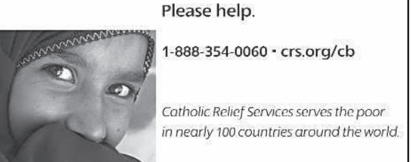
Catholic Relief Services serves the poor in nearly 100 countries around the world.

THANK YOU TO OUR ADVERTISERS FOR SUPPORTING OUR CHURCH COMMUNITY!